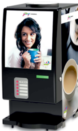
Dispenses 2 hot beverages

Unique mixing bowl for thorough mixing and rich crema