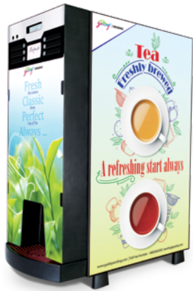
Freshly brewed tea & 2 beverages