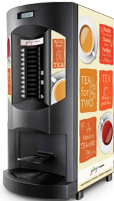
Freshly brewed tea & 5 beverages