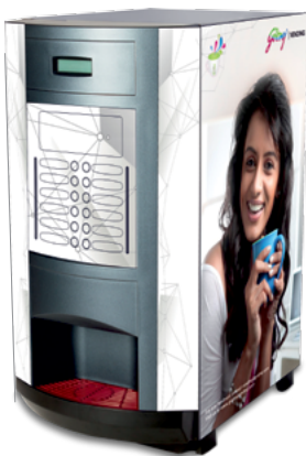
Dispenses 4 hot beverages or 8 recipes