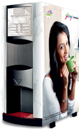
Dispenses 3 hot beverages or 6 recipes