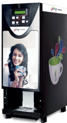
Dispenses 2 hot beverages or 4 Recipes